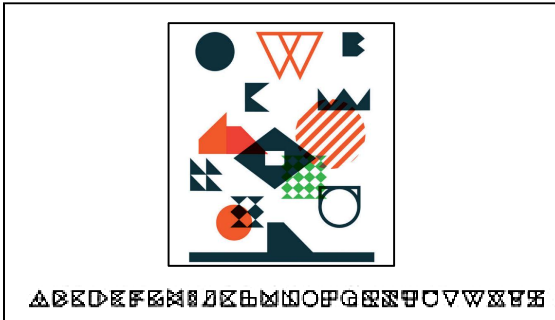
FIGURE D: BaBa Typeface by Garth Walker (South Africa), 2002.