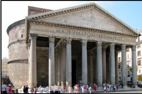
FIGURE F: The Roman Pantheon , commissioned by Emperor Hadrian (Rome, Italy), 113–125 CE.