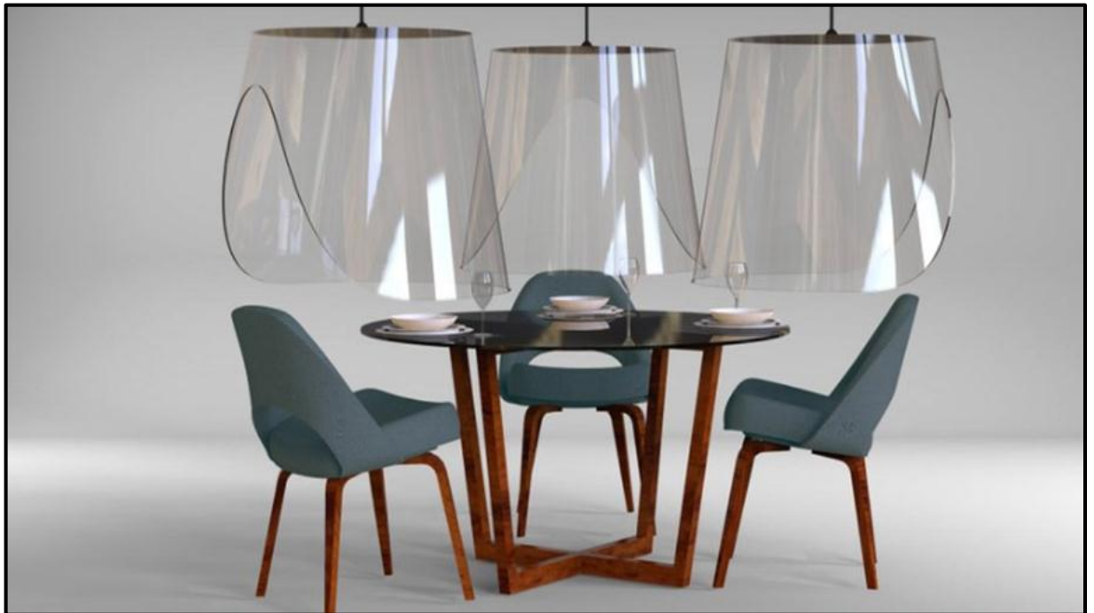
FIGURE J: Plex'eat Hoods for post Covid-19 dining in restaurants by Christopher Gernigon (France), 2020.