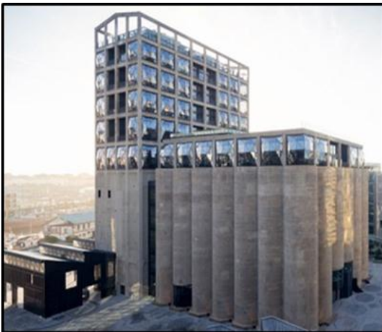
FIGURE G: Zeitz MOCAA (Museum of Contemporary African Art), a historical grain silo repurposed by Thomas Heatherwick Studios (Cape Town), 2017.