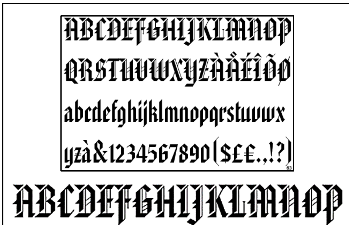
FIGURE E: Gothic Manuscript Typeface

Compare the typeface in FIGURE D with the typeface in FIGURE E.