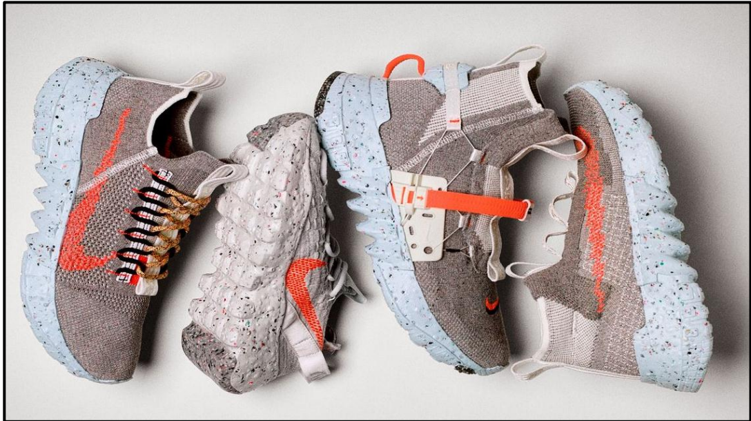
FIGURE L: Nike Space Hippiie 4 footwear by Noah Murphy-Reinhertz (USA), 2020.

Space Hippiie's sneakers are made from 85–90% recycled content. These eco-friendly sneakers are made entirely from scrap materials from the factory floor, including plastic bottles, T-shirts, and post-industrial scraps. 'Move to Zero' is Nike's journey towards zero carbon and zero waste to help protect the future of sport.