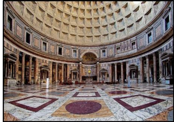
Detail of the Roman Pantheon interior. The dome ceiling consists of coffered concrete patterns.