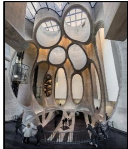
Atrium of the Zeitz MOCAA . The original interior structure of 56 tightly packed tubular, concrete grain storage silos was carved out to create the atrium.

Write an essay (at least ONE page) in which you compare the interior and exterior structure of the contemporary South African Zeitz MOCAA building in FIGURE G to the interior and exterior structure of the Classical building, the Pantheon, in FIGURE F.