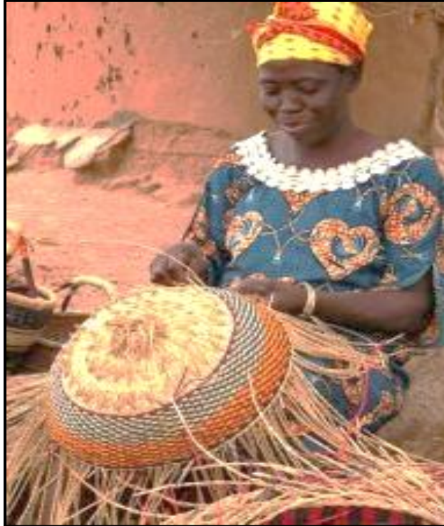
FIGURE K: Zulu basket weaving , Hlabisa, KZN, date unknown.