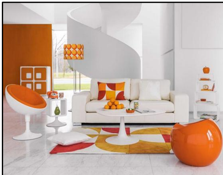
FIGURE I: Pop Style Interior , designer unknown (USA), date unknown.

Write an essay (ONE page) in which you compare the TWO interior designs above and explain how they are typical of the design movements they represent.