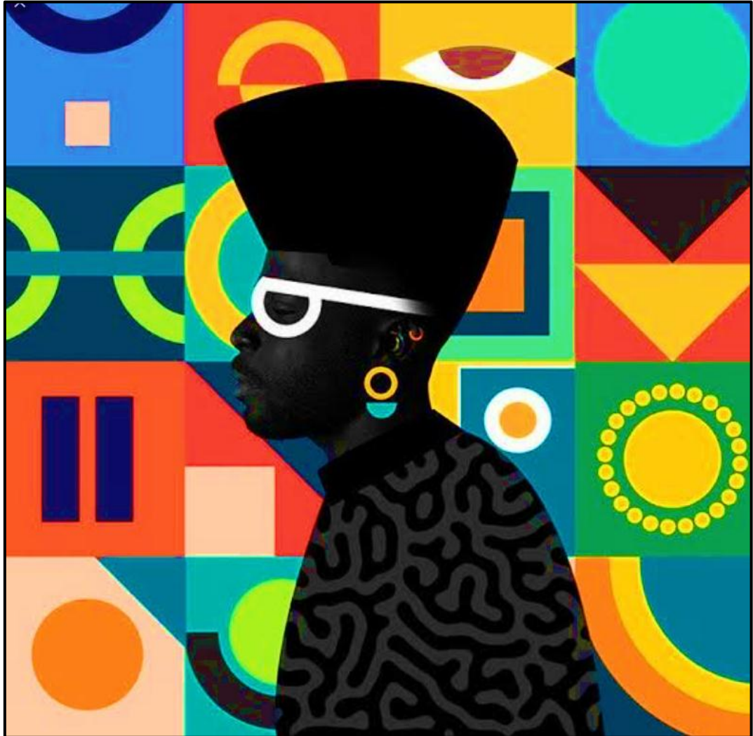
FIGURE A: Portraits and Colour wallpaper design by Temi Coker (USA), 2019.

Discuss the wallpaper design in FIGURE A above by referring to the following elements and principles: