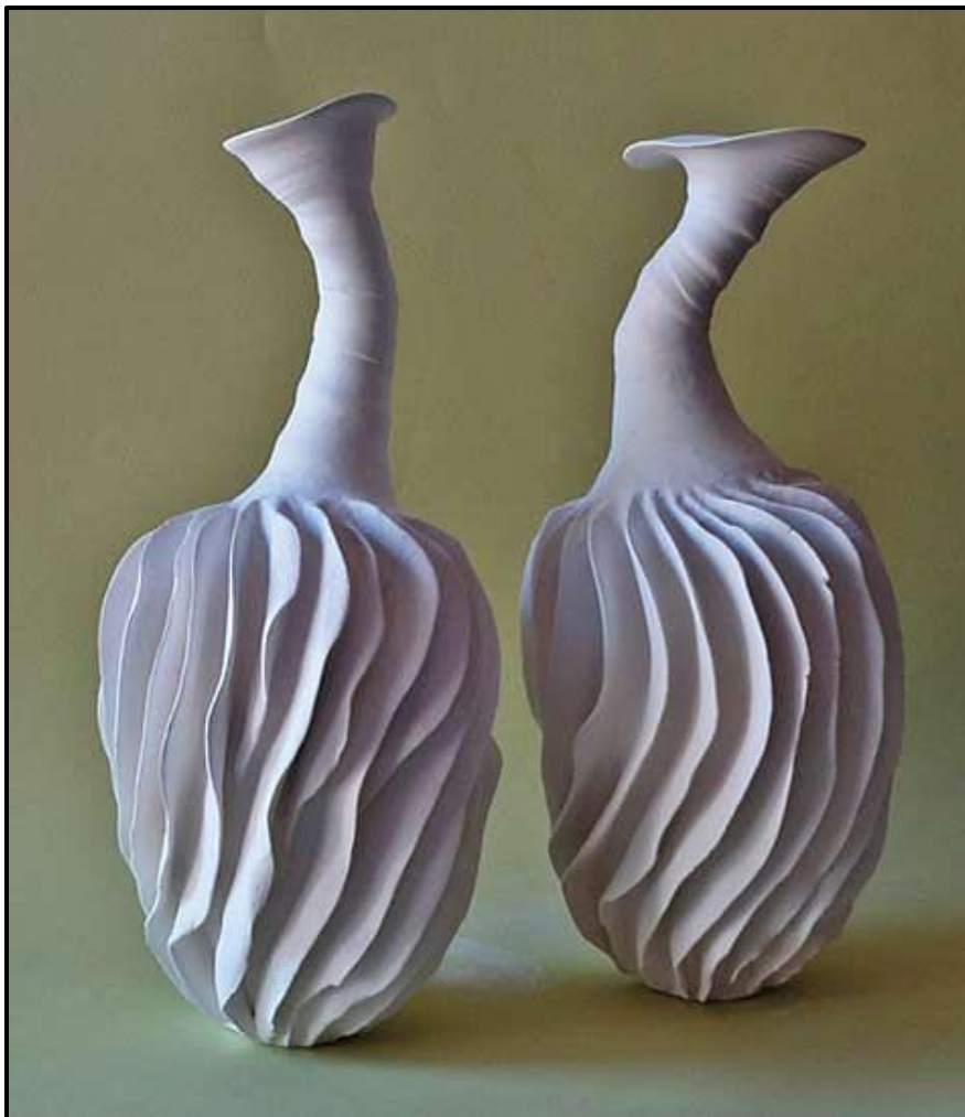
FIGURE B: Dancing Egrets (water bird) by Cecilia Robinson (South Africa), c. 2012.

Analyse the use of the following terms in relation to FIGURE B above: