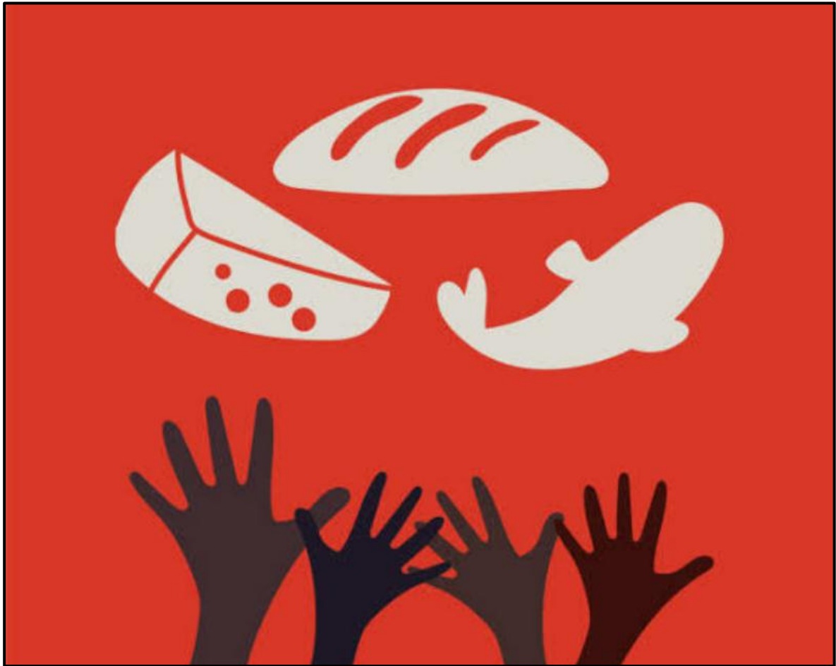
FIGURE C: Poster for Nutrition and Hunger , World Health Organisation, designer unknown, 2020.