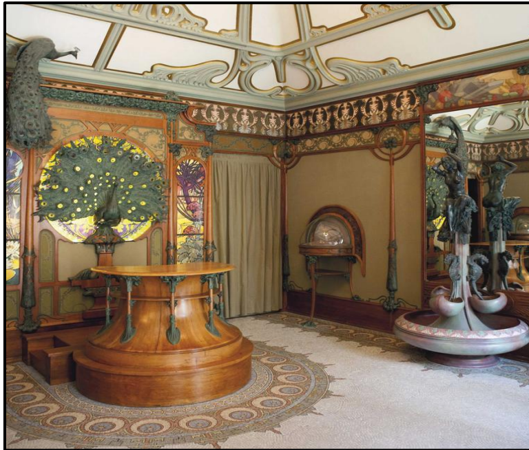
FIGURE H: Art Nouveau Interior of Fouguet's jewellery shop designed by Alphonse Mucha (Paris), 1900s.